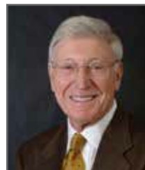
Bernie Marcus Chairman The Marcus Foundation