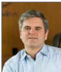
Steve Case Chairman The Case Foundation