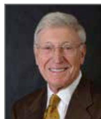
Bernie Marcus Chairman The Marcus Foundation