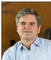
Steve Case Chairman The Case Foundation